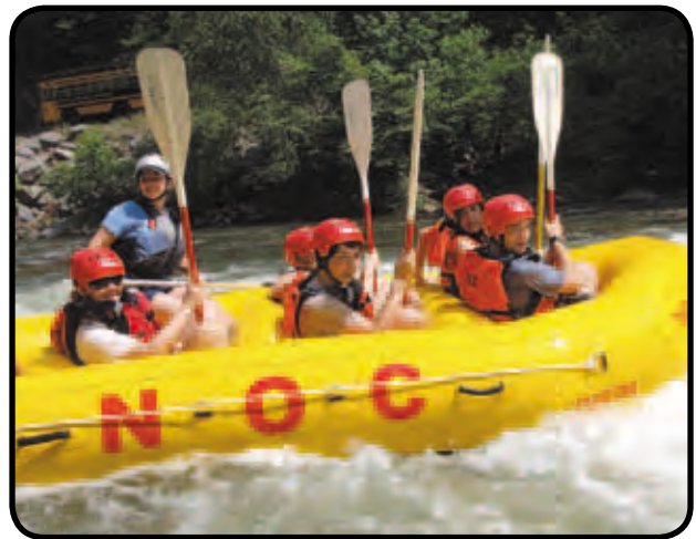
Whitewater Adventure Trip